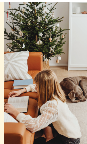
Cornerstone Group © 2023

Holiday gift shopping can easily turn into a stressful experience when you try to buy everything you think your kids "must" have. To simplify the process, some families have adopted the saying, "Something they want, something they need, something to wear, and something to read." This encourages parents to give just four gifts per kid—one per category. By doing so, more thought can go into the selection of each item, and the experience will hopefully be more rewarding for everyone.