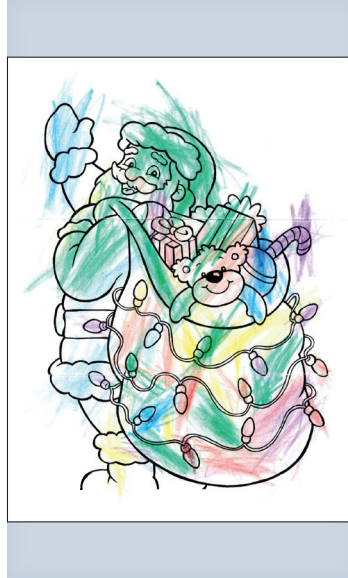
Preschool Ages 3–4 Winner: Easton