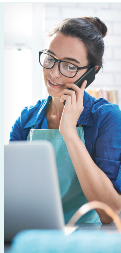
Cornerstone Group © 2025